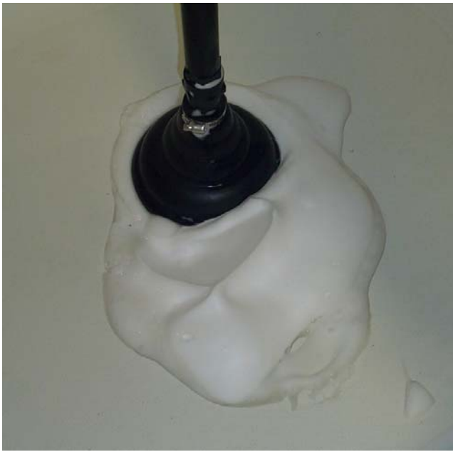
Foam penetrated deeply into drains for complete coverage and efficacy